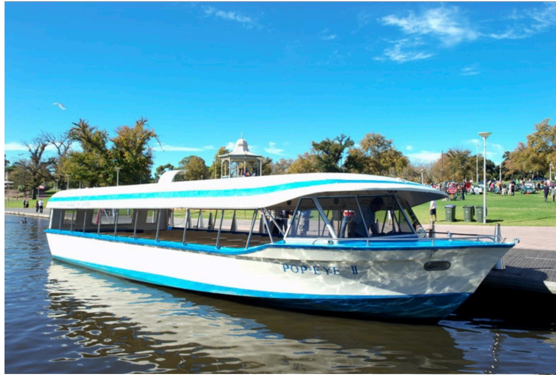
Group 1: Popeye Cruise

Group 2 will walk to Government House and Group 1 walk to Elder Park, and we will swap activities.