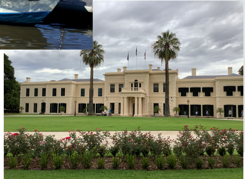
Group 2: Government House Tour